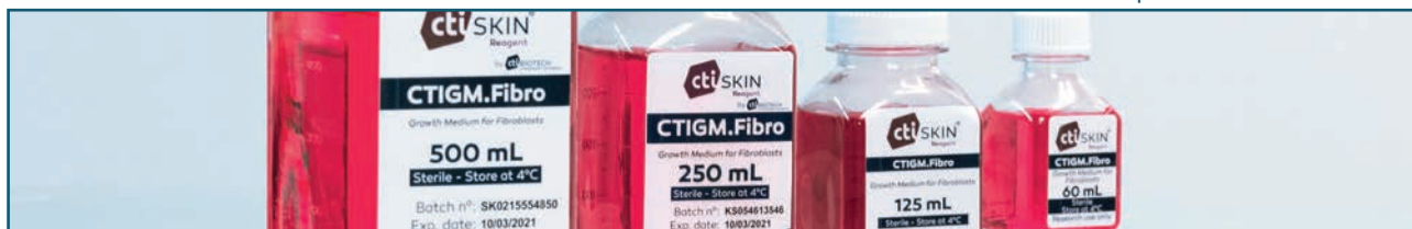
GROWTH MEDIUM Fibro GROWTH MEDIUM Kerat GROWTH MEDIUM Sebo GROWTH MEDIUM Melano GROWTH MEDIUM Adipo GROWTH MEDIUM PBMC