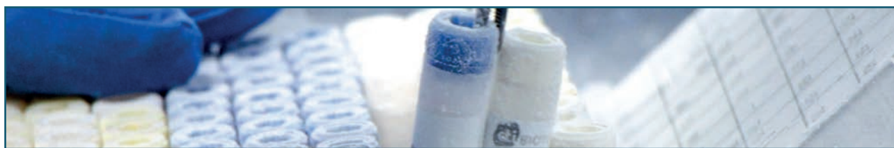
CRYOTUBE Fibro CRYOTUBE Kerat CRYOTUBE Sebo CRYOTUBE Melano CRYOTUBE Adipo CRYOTUBE PBMC