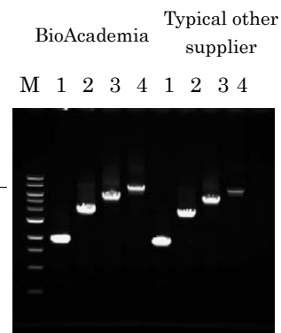
Fig.1 SDS-PAGE of Taq DNA polymerase