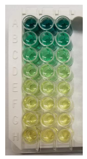
Figure 1: Color Visualization of Ammonia Assay Standard Curve.