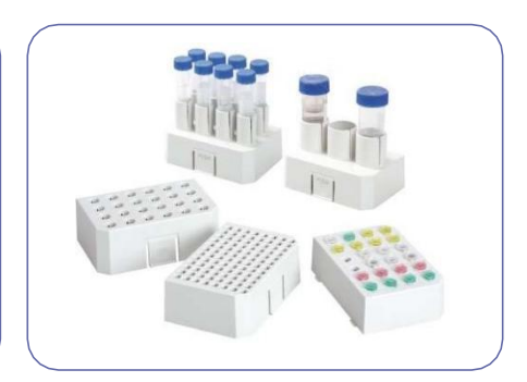
Easy to replace blocks