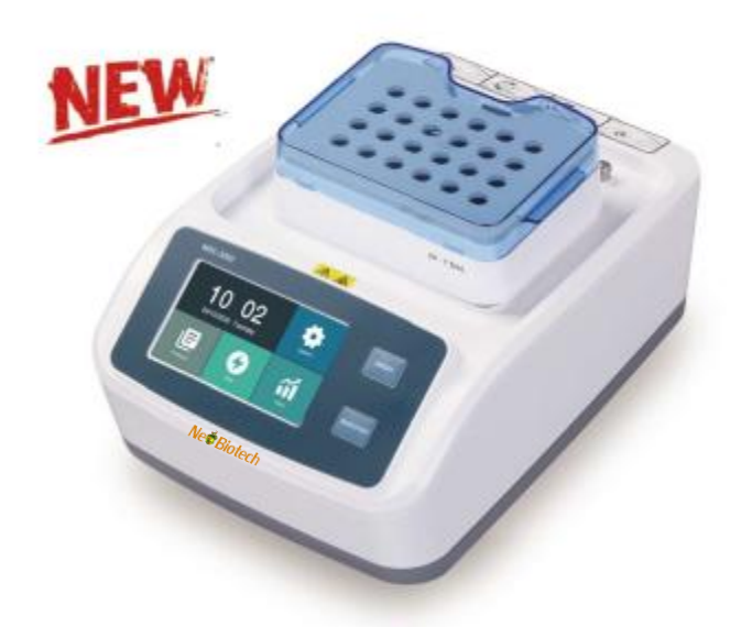
MSC-3000 / MS-3000

Convenient block replacement method, only need to flip the block handle to quickly replace. In addition, thermo lid accessories with a magnetic port design can effectively improve the temperature uniformity in the test tube, avoid changes in the concentration of Reagents in the test tube caused by liquid evaporation and condensation, and ensure the stability of the reaction conditions.