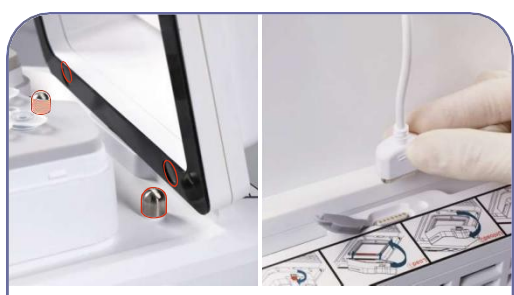
Magnet port, easy and fast installation; stable data transmission to ensure thermo lid performance