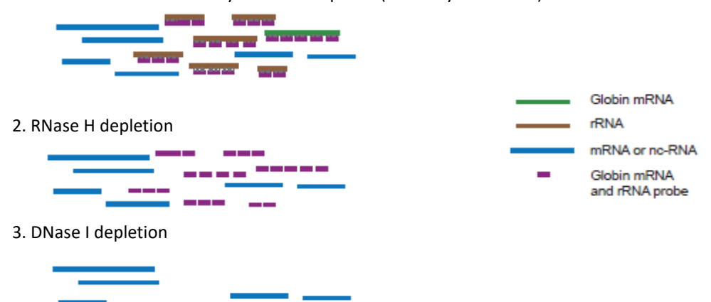
Fig 1. Schematic Diagram of Globin mRNA and rRNA Removal

1. Globin mRNA and rRNA hybridize with probe (Probe hybridization)